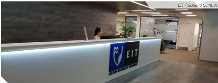
EIT Auckland Campus