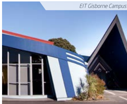
EIT Gisborne Campus